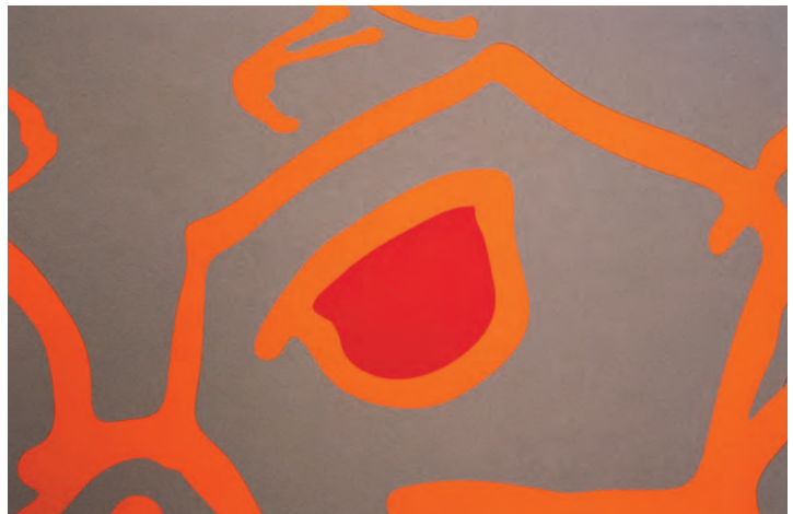
close up Dutch Flowers