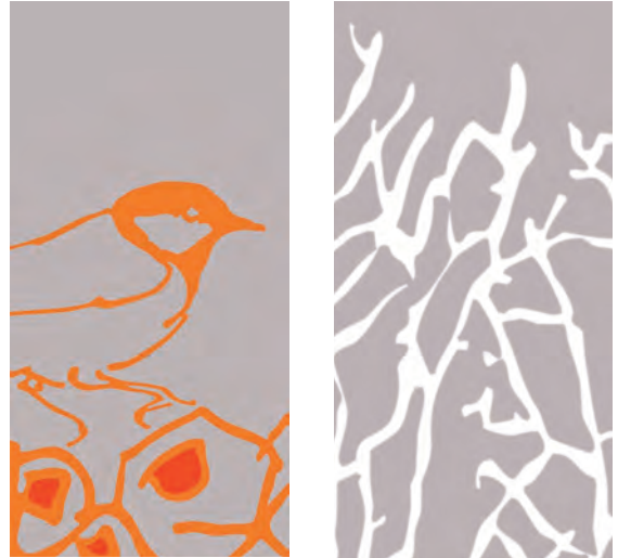
examples of bespoke designs